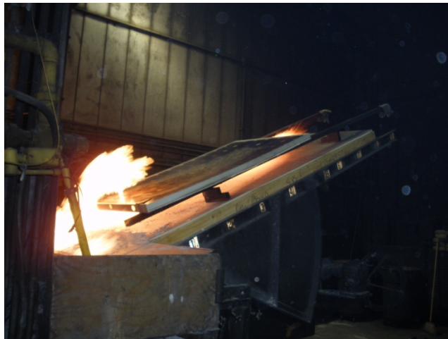
Figure 9 Spread of Flame Test for noncombustible roof with PV noted in Figure 8.