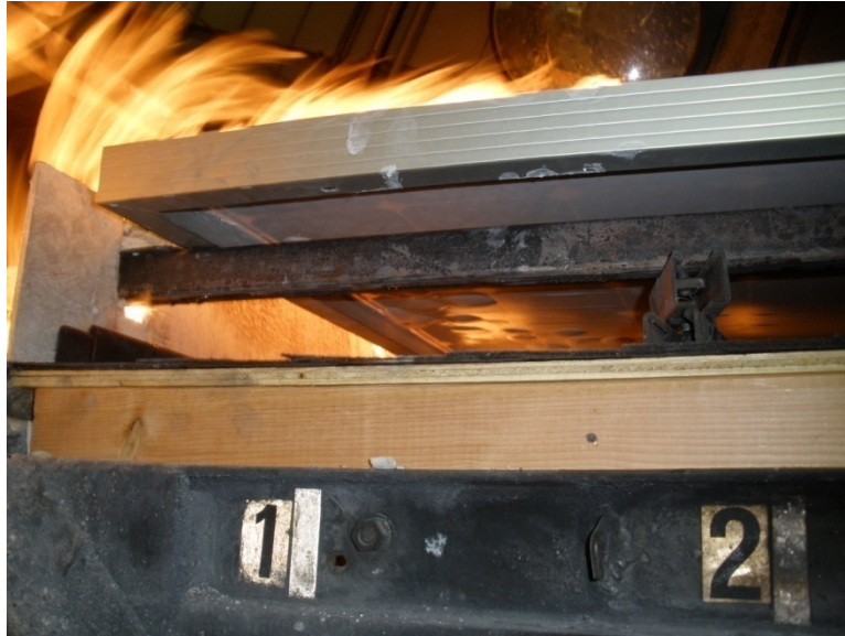
Figure 14 Spread of Flame Test for Setup shown in Figure 13