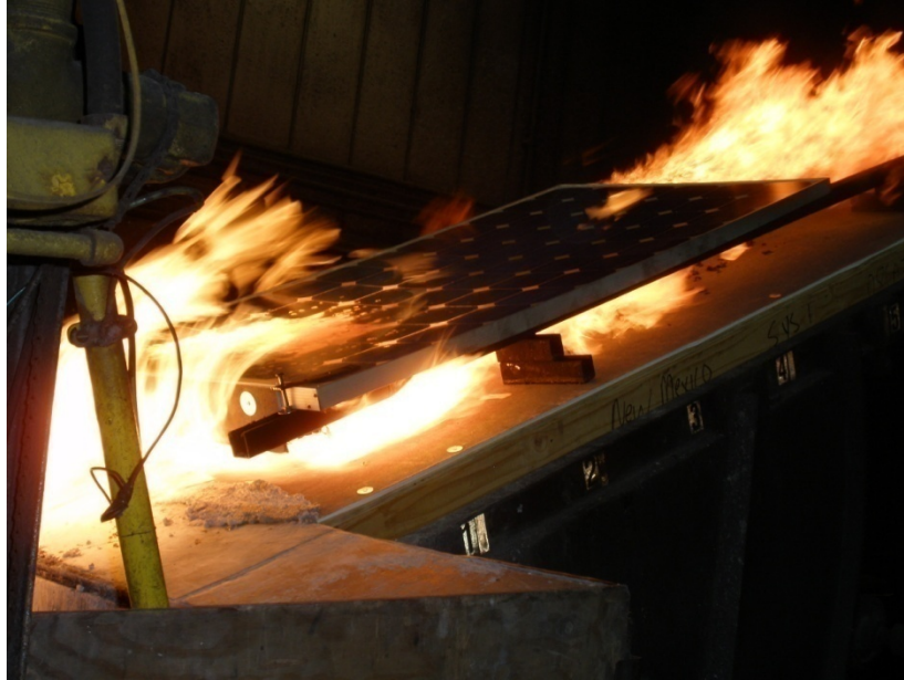
Figure 2 Photograph of Spread of Flame Test for Setup described in Figure 1.