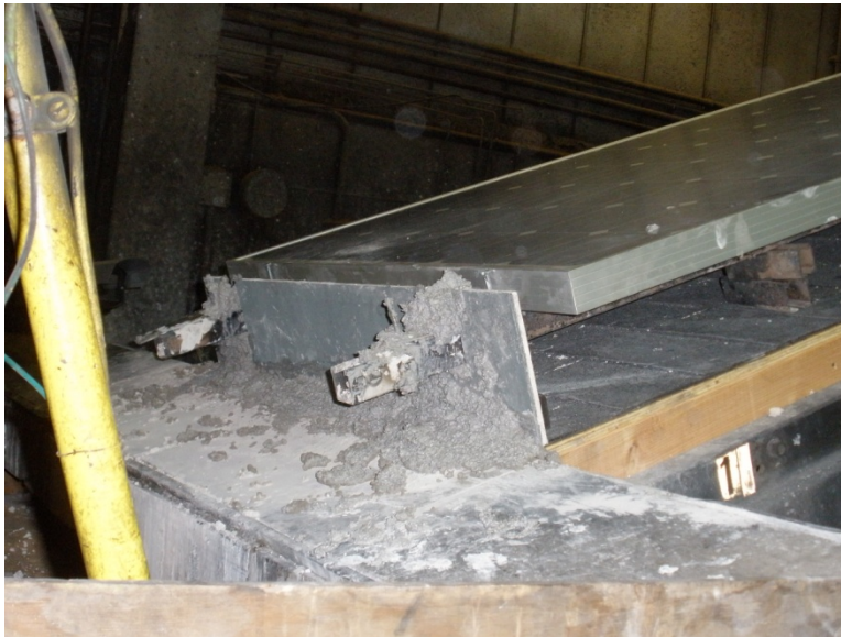
Figure 13 Setup for Class A roof with a Class C PV modified with noncombustible flashing with a 0" vertical gap and the module's leading edge 3" from the flashing