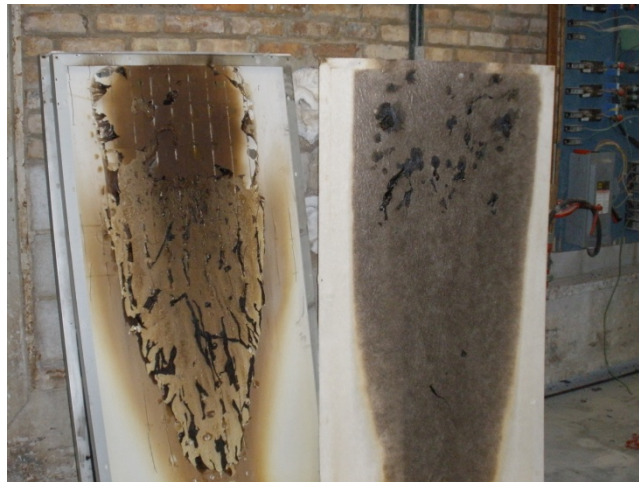
Figure 7 Photograph after the Spread of Flame test for noncombustible roof (right) and Class C PV (left) modified with noncombustible ¼" board mounted directly to the back of the PV