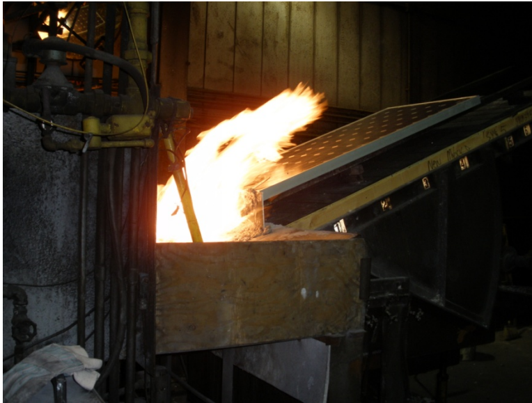
Figure 12 Spread of Flame test for setup shown in Figure 11.