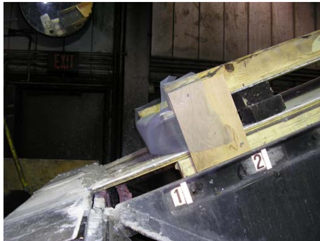
Figure 19 Photograph of noncombustible roof with noncombustible PV surrogate modified with a small opening screen flashing