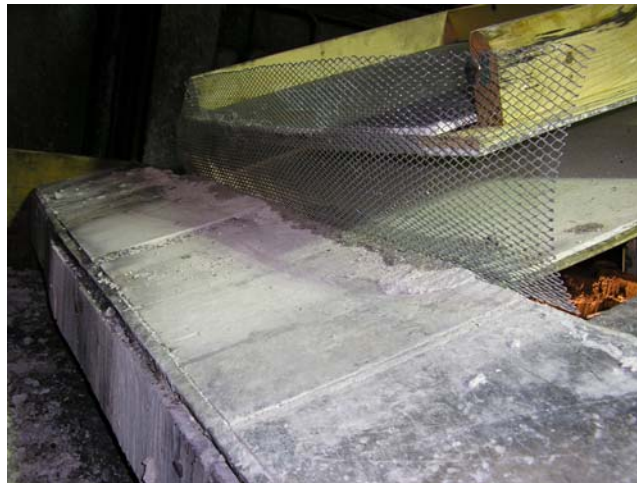
Figure 17 Photograph of noncombustible roof with noncombustible PV surrogate modified with a large opening screen flashing

Visual results are provided in the photographs Figure 17 through Figure 20 and with test observations summarized in Table 2 and Table 3.