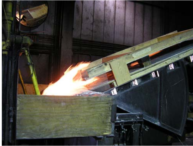
Figure 18 Photograph of Spread of Flame Test showing flame extension through the large opening screen flashing.