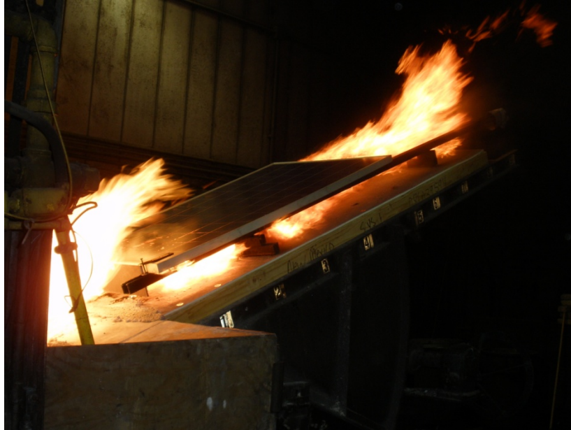
Figure 4 Photograph of Spread of Flame Test for Setup described in Figure 3.