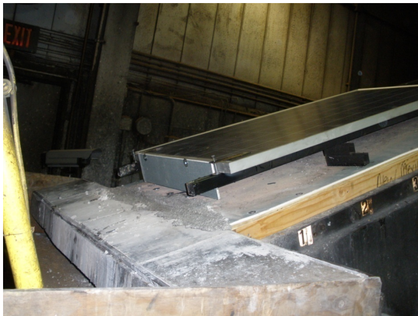
Figure 3 Photograph of noncombustible roof with Class C PV and modified vertical noncombustible flashing with 1” gap between bottom of flashing and roof surface.