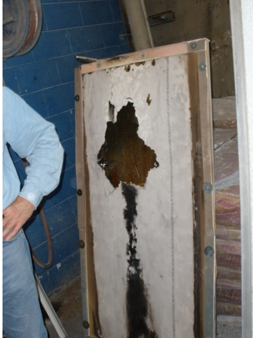
Figure 10 Photograph of Class C PV with commercially available fire barrier sheet mounted directly to the bottom of the module after the Spread of Flame test