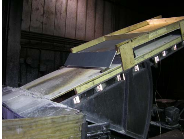
Figure 20 Photograph of noncombustible roof with noncombustible PV surrogate modified with a noncombustible angled flashing