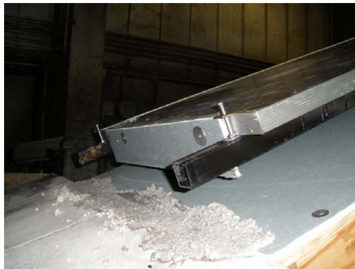
Figure 1 Photograph of noncombustible roof with Class C PV and modified vertical noncombustible flashing with 2" gap between bottom of flashing and roof surface

Visual results are provided in the photographs as shown in Figure 1 through Figure 15.