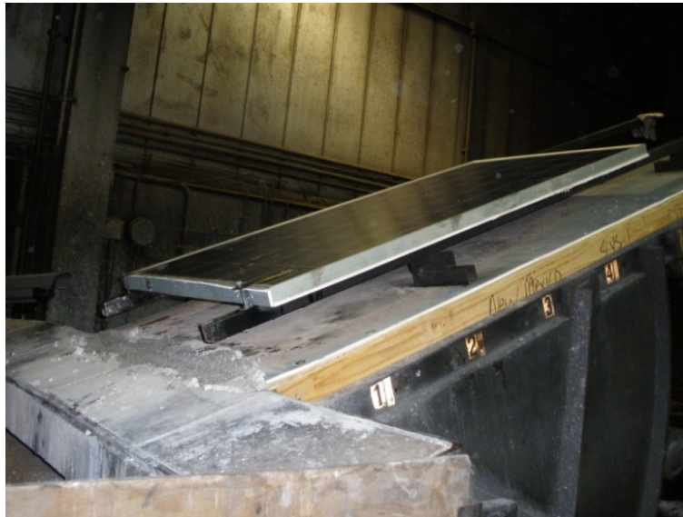
Figure 5 Photograph of noncombustible roof with Class C PV modified with a noncombustible 1/4" board mounted directly to the bottom of the module