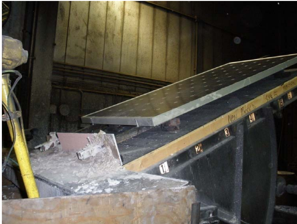
Figure 15 Setup for Class A roof with Class C PV modified with noncombustible flashing with 0" vertical gap and 12" distance from module leading edge