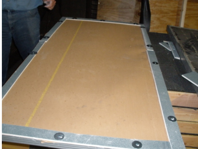
Figure 8 Photograph of Class C PV with commercially available fire barrier sheet mounted directly to the bottom of the module