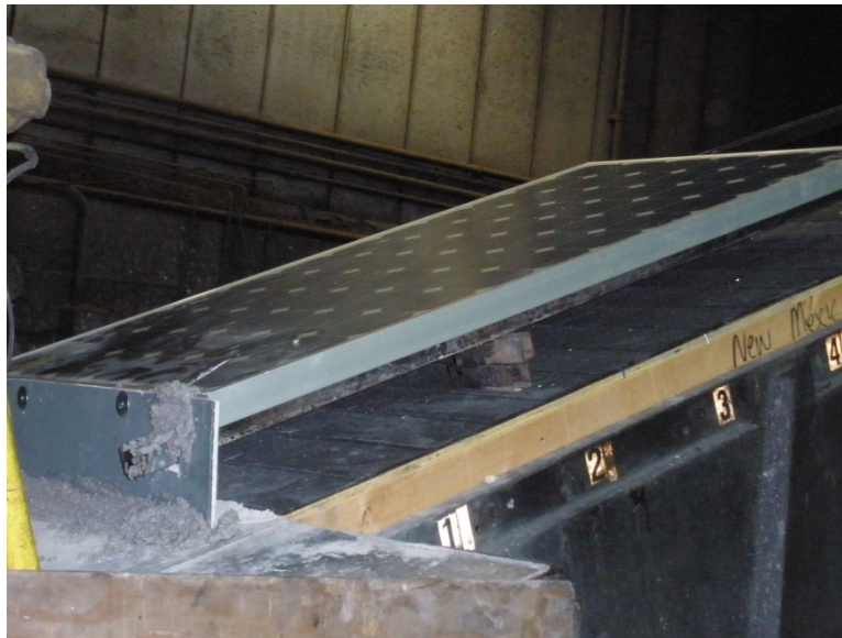
Figure 11 Setup for Class A Shingle (3 tab) roof with Class C PV modified with noncombustible flashing connecting leading edges of PV and roof