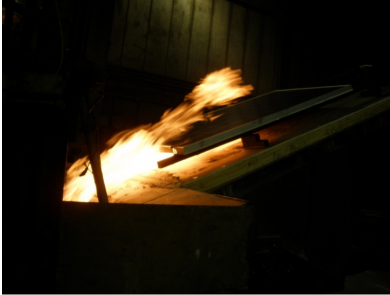
Figure 6 Spread of Flame Test for Setup in Figure 5.